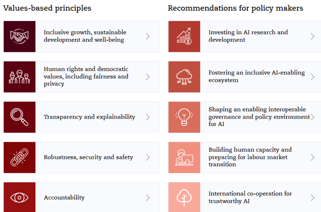
Figure 5 OECD AI Principles