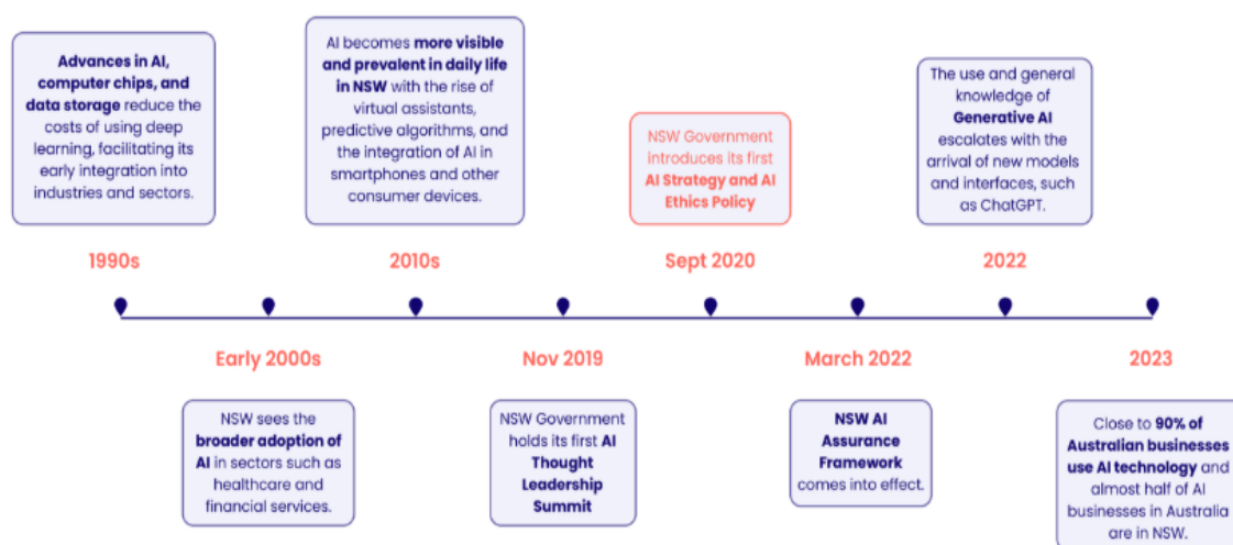
Figure 1 A timeline of AI developments in New South Wales