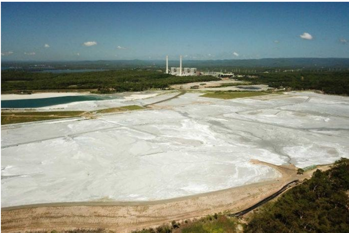
Moonscape opposite approved housing estate at Doyalson...

Cancers and respiratory conditions are rampant in all local communities with figures from the Australian Cancer Atlas and Bureau of Statistics having the small township of Budgewoi being 102% above the Australian average for Head and Neck cancer.