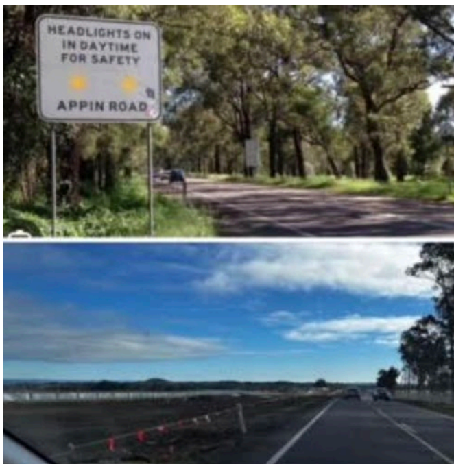
Figure 1: Appin Rd before and after TfMNSW road widening