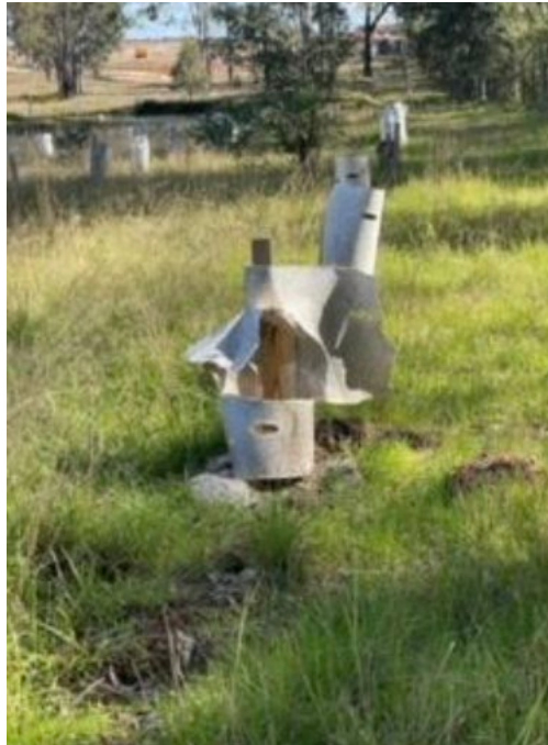
Figure 2/3/4 Dead Offset planting Campbelltown