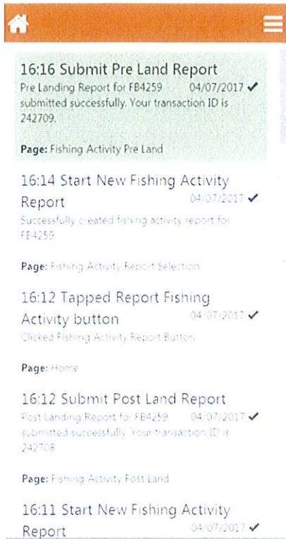
Screenshot 7: FisherMobile real time activity logging screen showing recent FisherMobile application history.