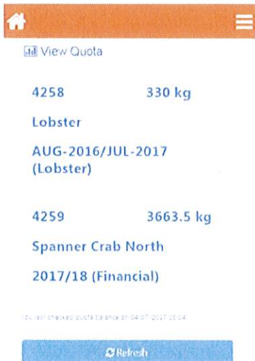
Screenshot 2: FisherMobile view quota balance screen showing the quota relevant real time quota balances.