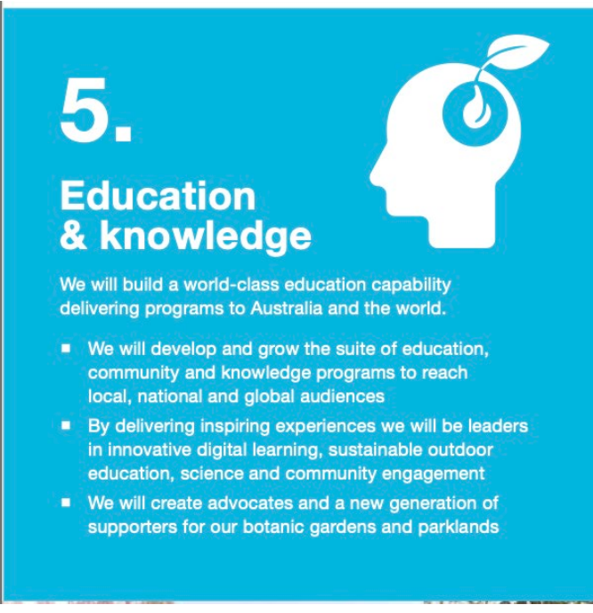
CMPT MANAGEMENT PLAN 2018

The <u>2013 Centennial Park Master Plan</u> mentions a "revitalised" Education Precinct, however the Ian Potter Wild Play had not yet been built. CEND is not listed in the 2013 Centennial Park Master Plan Vol 1 "Costing and Implementation Plan to 2040, some $36m in costed projects.