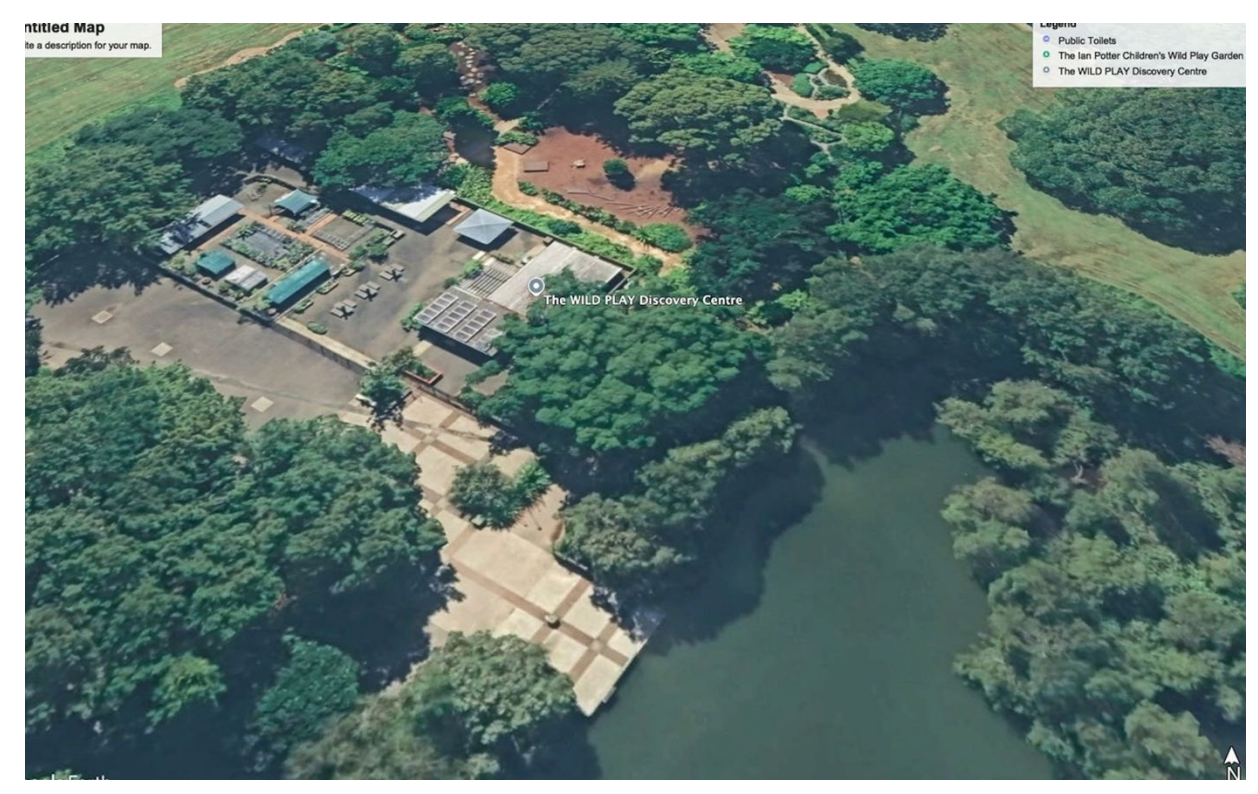
SITE OF THE NEW CEND

4 Case Study Intransparency "Centre for Excellence in Nature Discovery"