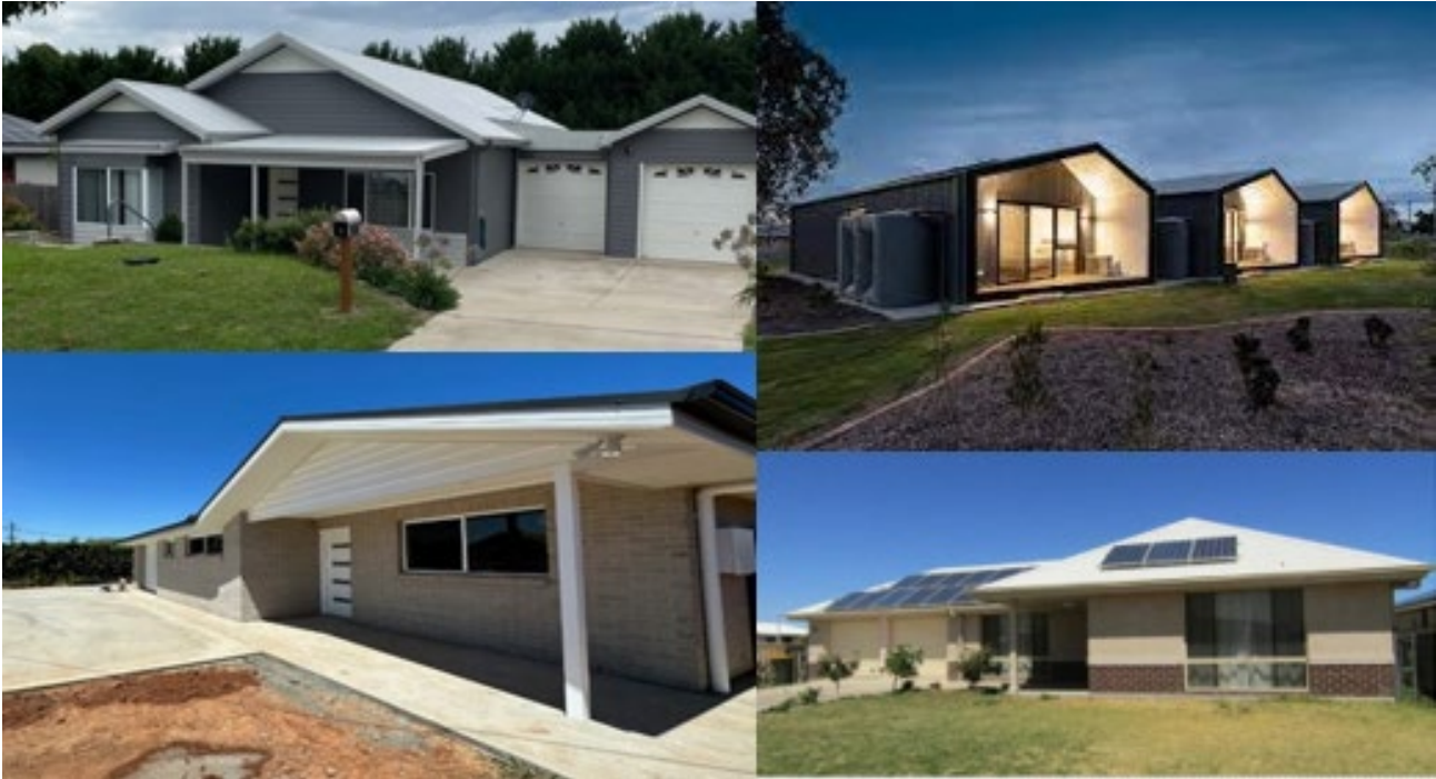
Figure 2: New Supply of Teacher Police and Health Worker Homes