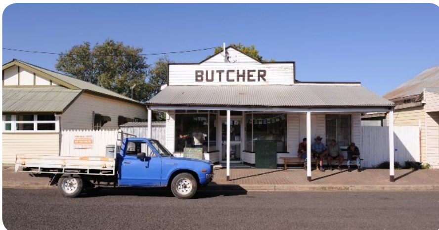
Integrated research that informs and supports change to enhance regional communities.

OUTCOMES: help inform sound industry and policy activities to satisfy the social licence to operate.