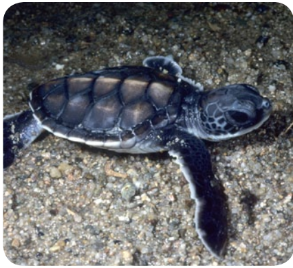
Research to minimise impacts on the marine ecosystem.